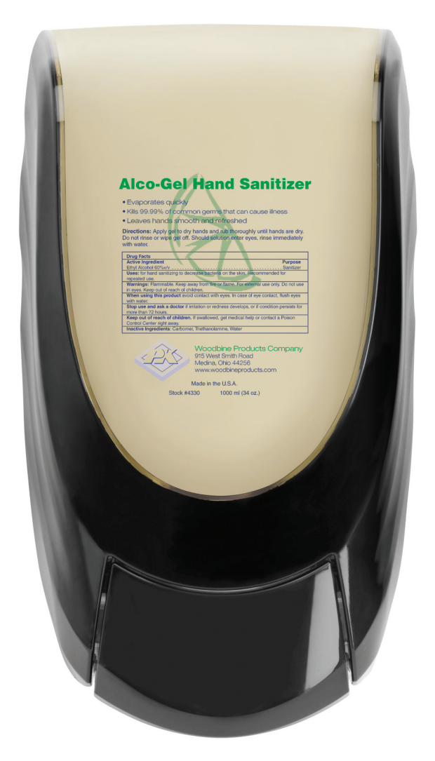
Manual Dispenser #8007 Refill - #4330 Alco-Gel Hand Sanitizer