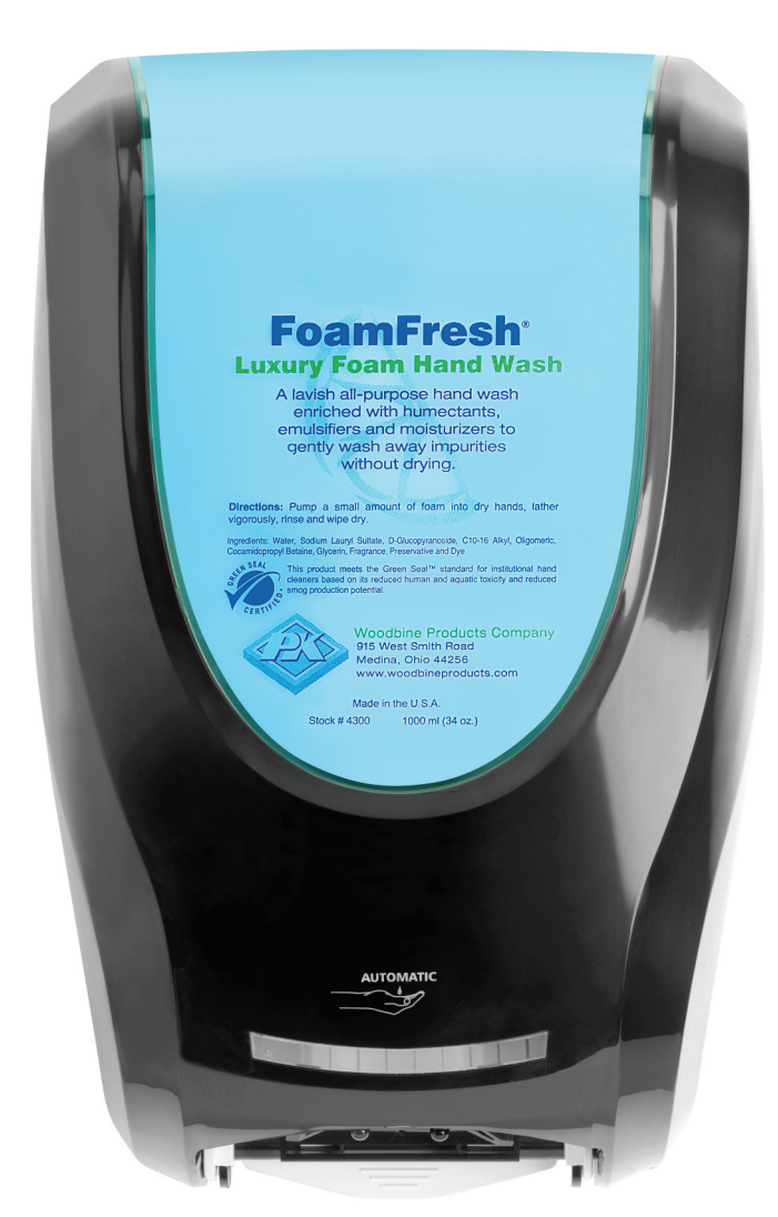
Auto Dispenser #8107 Refill - #4300 Luxury Foam Hand Wash