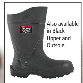
Also available in Black Upper and Outsole.